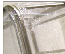
Nylon Rack Cover