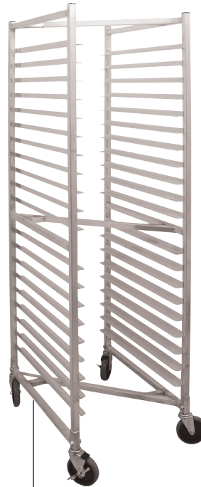
Item 23834 Stainless Steel Pan Rack 20 Slides Square Top Knock Down