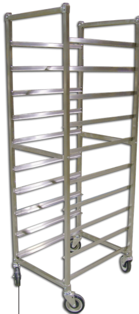
Item 23833 Stainless Steel Pan Rack 10 Slides Square Top Knock Down