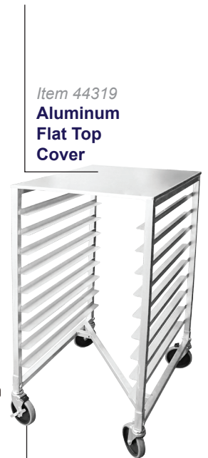
Item 44319 Aluminum Flat Top Cover