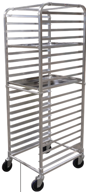
Item 28351 Aluminum Pan Rack 20 Slides Curve Top Welded