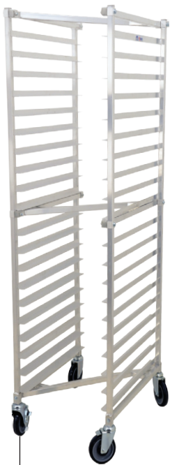
Item 43474 Aluminum Nesting Sheet Pan Rack 20 Slides Square Top Knock Down